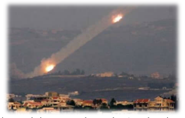
it may bring sympathy to the Assad regime and complicate matters for the United States.

Another scenario is to take advantage of Syria's weakness to secure some territorial gains in the Golan for possible use in future negotiations. But such scenario remains remote in the present circumstances because